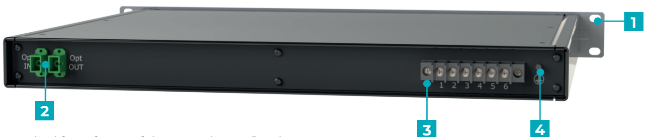
Figure 2.1: PSC-3 design. Numbered items are identified in Table 2.1.

The standard form factor of the PSC-3 is 1U 19" rack-mount, but other options may be considered based on the use case.